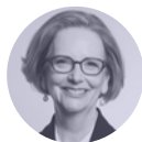
Julia Gillard Former Prime Minister of Australia and Chair of the Global Institute for Women's Leadership

Gender equality is both an urgent economic goal and a timeless moral imperative, yet the pandemic has placed hard-fought gains for women's empowerment under threat. Almost two years into the crisis, Covid continues to expose deep-rooted inequalities in our social, political, and economic systems, while simultaneously underlining society's reliance on women, both on the frontline and at home.